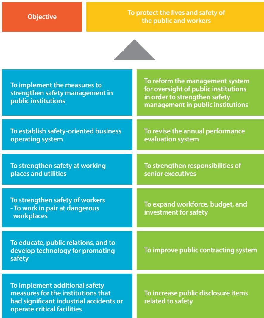
<Figure 2-1> Policy Measures for Strengthening Safety in Public Institutions